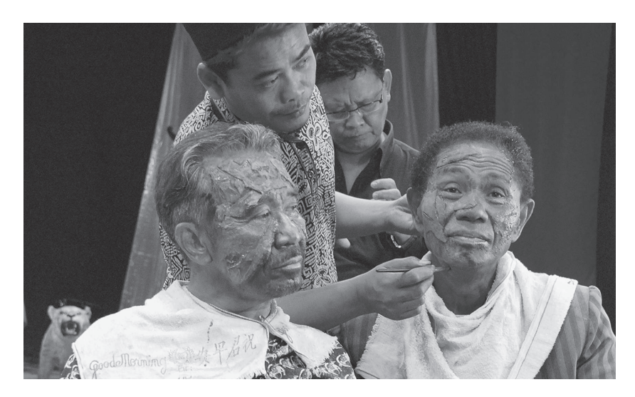
Image 14.16. Cumulative wounds as necrophiliac jewelry, The Act of Killing (2012).

their own frozen victim parts. A precondition for healing would be that they find access to both parts of their (subconscious) persona.