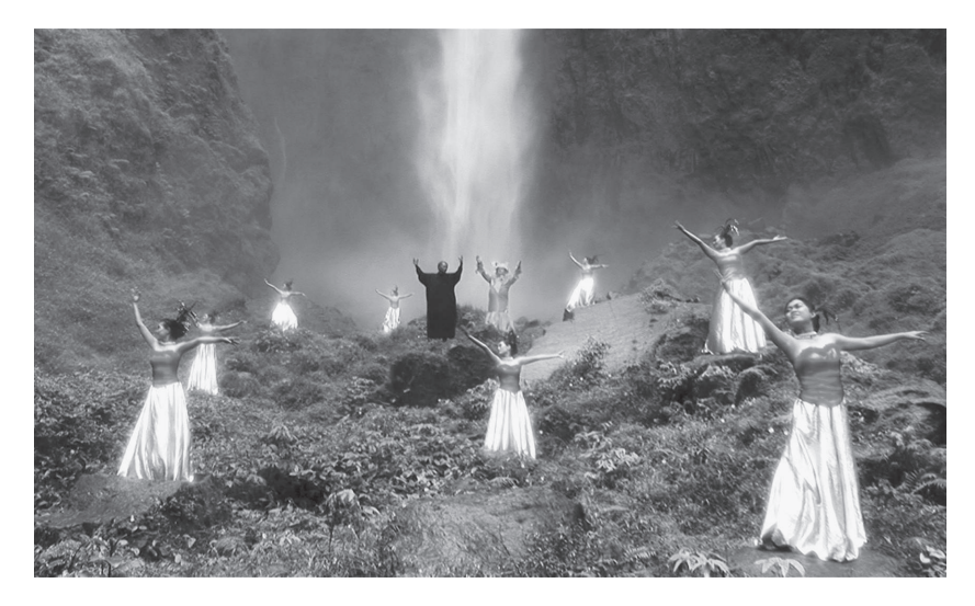
Image 14.17. Purifying waterfall of forgiveness, The Act of Killing (2012).

processes of rewriting historiography. It portrays individual perpetrators, who have since lived unmolested, more or less 'happy,' enlightened, or almost remorseful in today's Indonesia, and who participate in criminal affairs of the state to this day. The film does not condemn them; perpetrators are not stigmatized as "evil," "devilish," "monstrous," "barbaric," or "bestial," nor does the film seek to rehabilitate them socially, for they are socially integrated based on the continuity of their power, albeit feared or shunned by descendants of victims. Rather, The Act of Killing focuses on their ordinariness and their humanity, their suffering, their self-doubts and weaknesses, challenging strict categorizations such as "perpetrators" and "victims." It does not address the mass murderers as the only individuals responsible for the escalation in the massacres. Instead, it refers to the sociopolitical framework that promoted violence, and explores how this is related to today's repression strategies of perpetrator groups in North Sumatra.