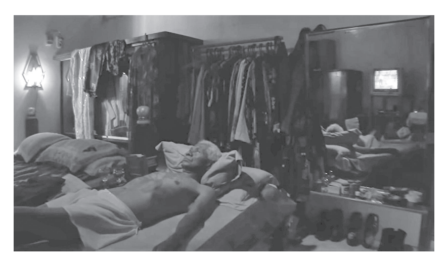
Image 14.1. One of Anwar's post-atrocity perpetrator symptoms is insomnia, The Act of Killing (2012).

imaginary insofar as it uses cinematic narrative to rewrite mental images of violence and guilt, which actively shape the perception of genocidal history and post-genocidal presence that is still characterized by repression. It reveals that 'historical facts' are rarely purposeless, but rather a system of statements that are constantly reconfigured and often close to centres of power.