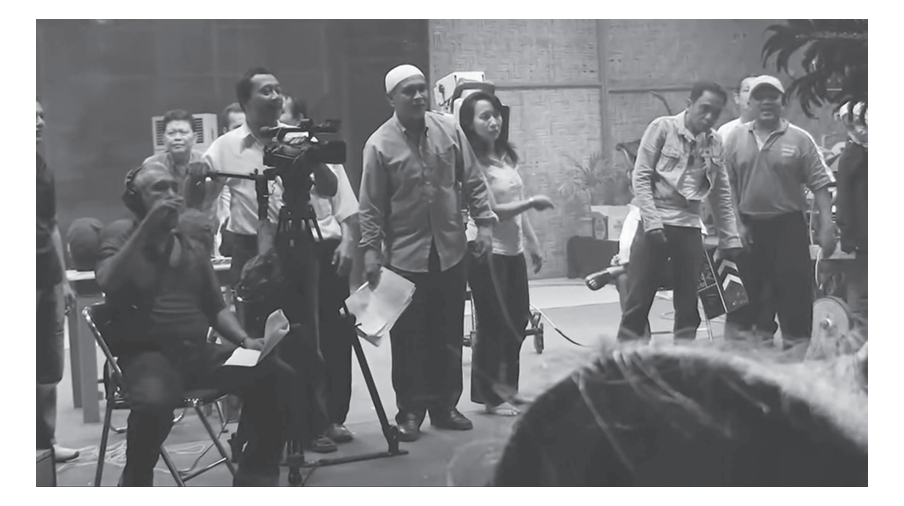
Image 14.8. Film set with perpetrators, film crew including activists, and a descendant of a former victim, The Act of Killing (2012).