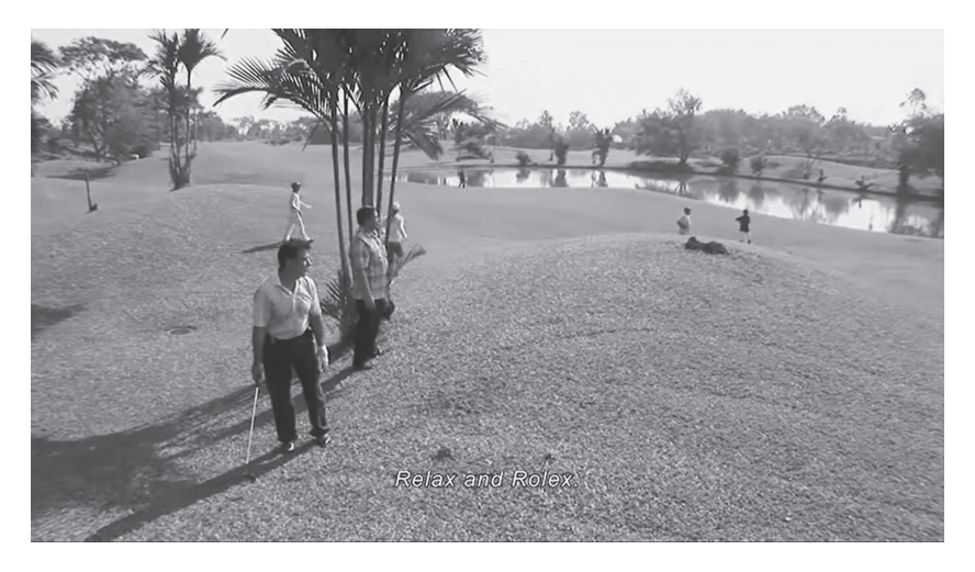
Image 14.5. Relax and Rolex!, The Act of Killing (2012).